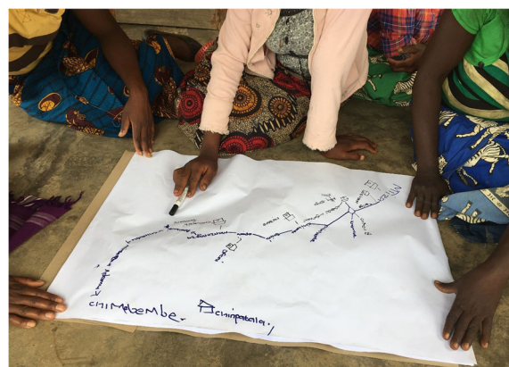
Fig. 1 Participatory GIS/map drawing, Malawi 2017.

preliminary analyses of a combination of Equitable survey data, GPS coordinates of households and health facilities. The map shows households selected in the Rumphi district in northern Malawi. It identifies clusters of households that are classified within the categories B and C from Table 1 above, i.e., households where the self-reported access is worse than average, but measured access is better than average (measured access is better than perceived access; B), and vice versa (measured access is worse than perceived access; C). The clusters were identified by regressing age, health status and household distance to health facility on perceived access. The predicted residuals from this regression were then used to categorise the households into categories A-D. Going ahead, we will also want to explain the variation in other relevant dependent variables including (but are not limited to) local prevalence of disability and barriers to access. Statistical techniques include traditional regression analysis, but also more explicitly spatial modeling tools such as spatial regression analysis and spatial clustering techniques based on Getis-Ord G_i^* local statistics. The latter technique will enable us to determine